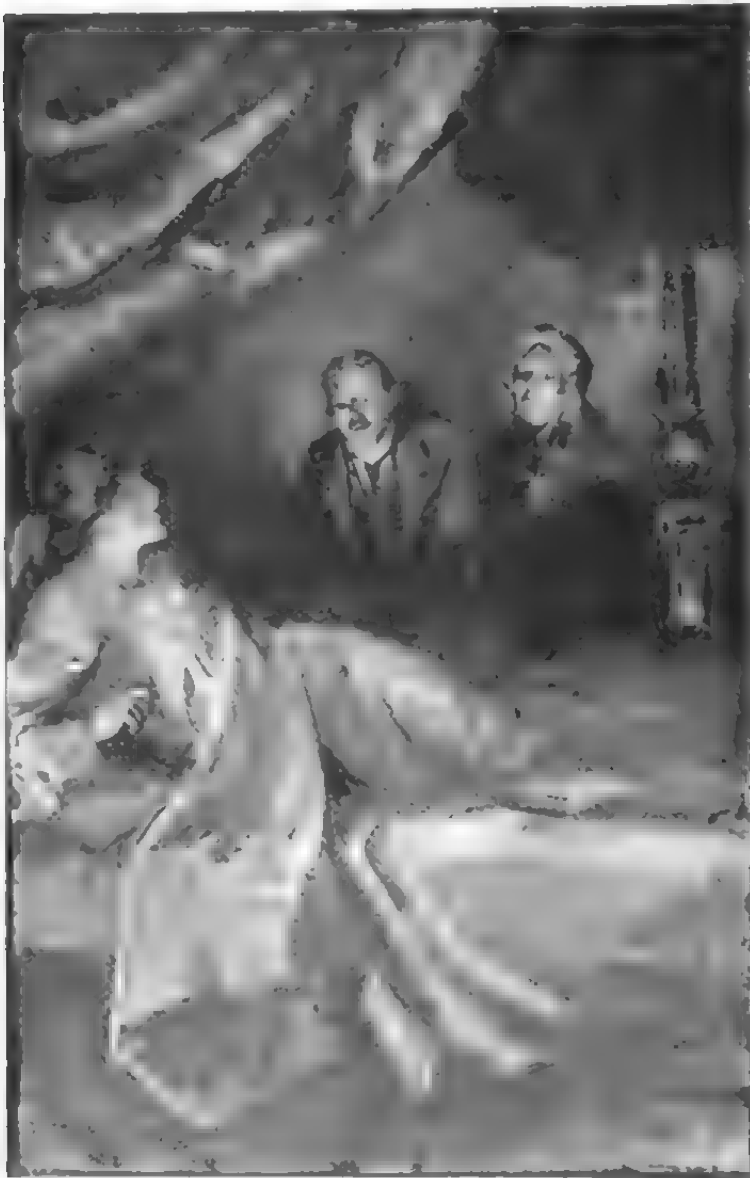
She was sitting half up in bed . . . appearing to stare with the most deadly fear at the opposite wall.